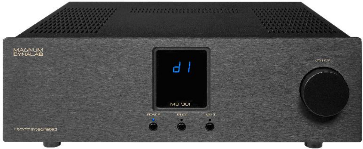
DIAGRAM OF MD 301 HYBRID INTEGRATED AMPLIFIER